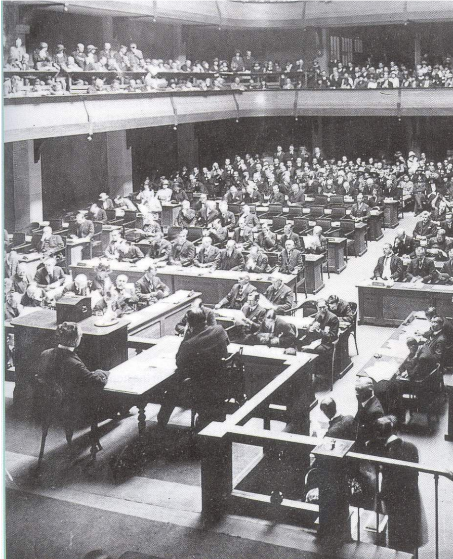
The Assembly of the League of Nations in session, Geneva 1923.

6 Study the picture, and then answer the questions which follow.