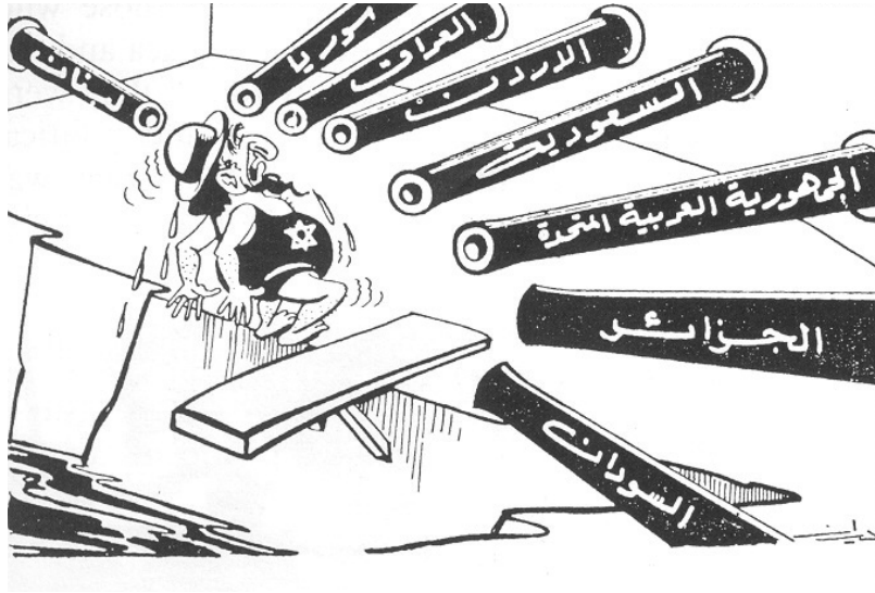
A cartoon published in May 1967 showing Israel facing the armed forces of eight Arab states.

20 Study the cartoon, and then answer the questions which follow.