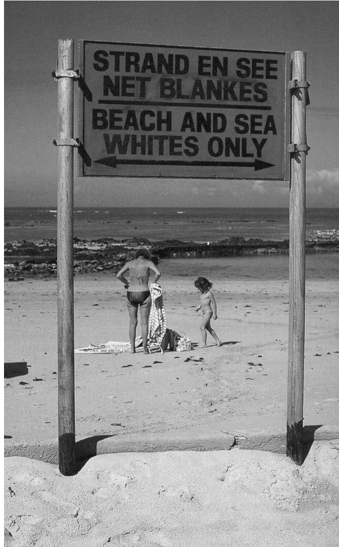
The Separate Amenities Law in action.

18 Study the photograph, and then answer the questions which follow.