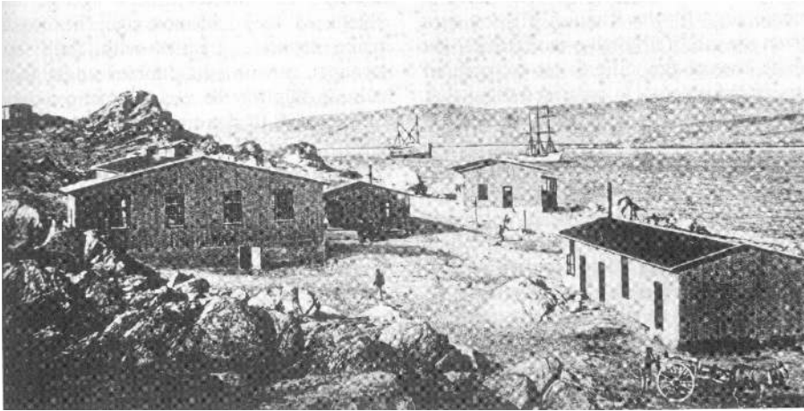
The German trading post at Angra Pequena, Namibia.

19 Study the illustration, and then answer the questions which follow.