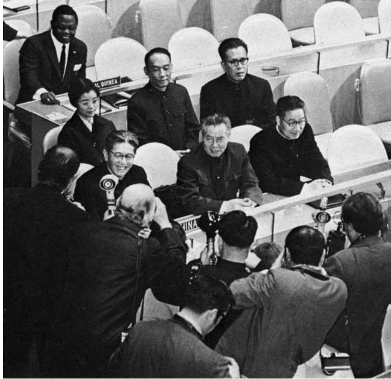
The delegation from the People's Republic of China taking their seats for the first time at the UN, 1971.

15 Study the photograph, and then answer the questions which follow.