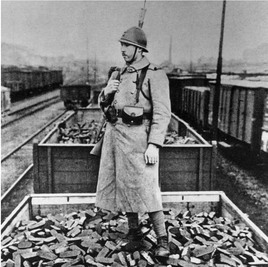
A French soldier guarding a train full of German coal from the Ruhr in 1923.