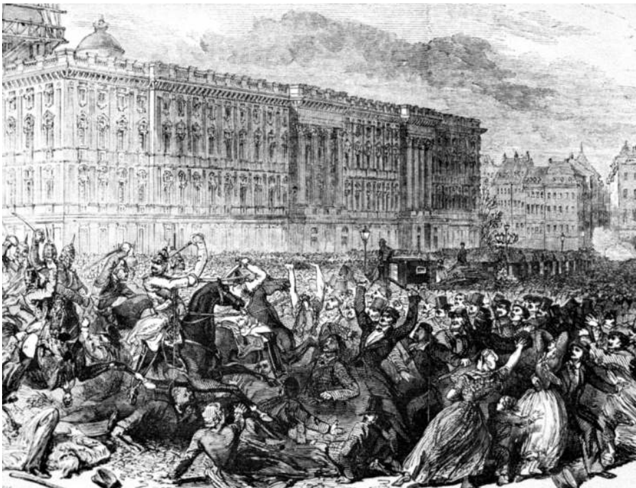
Prussian cavalry charging rioters in front of the Royal Palace, Berlin, 1848.