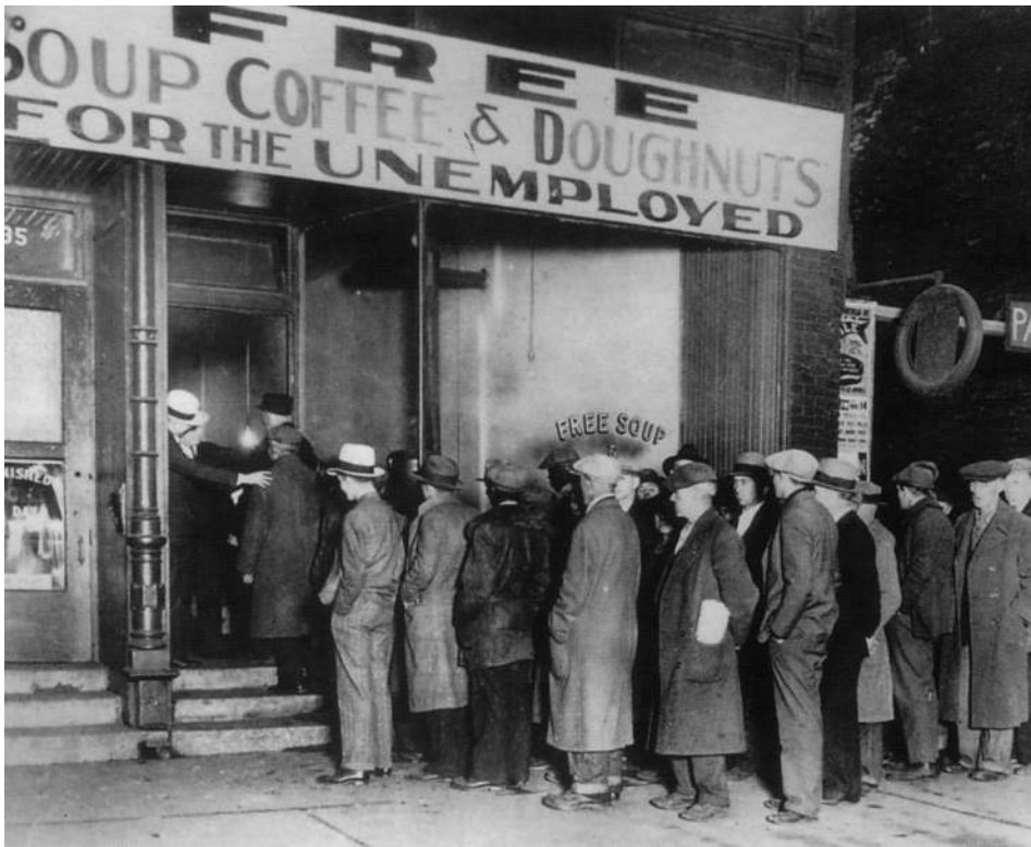
Unemployed people queuing at Al Capone's soup kitchen in Chicago in 1930.

13 Study the photograph, and then answer the questions which follow.