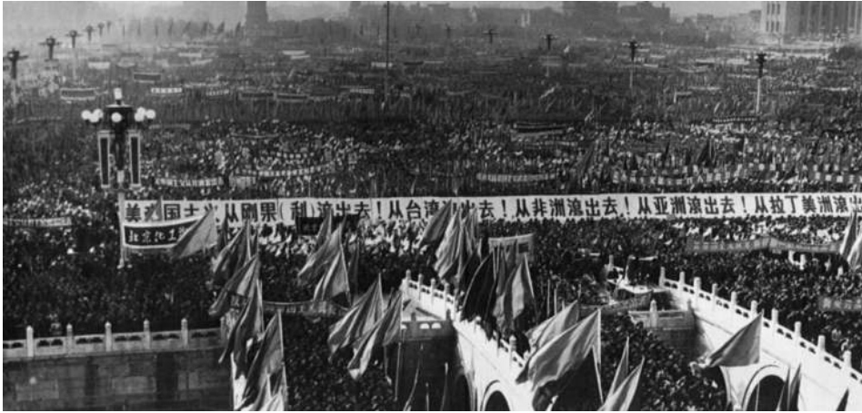
A rally of 700 000 Red Guards in Beijing in 1966.

16 Study the photograph, and then answer the questions which follow.