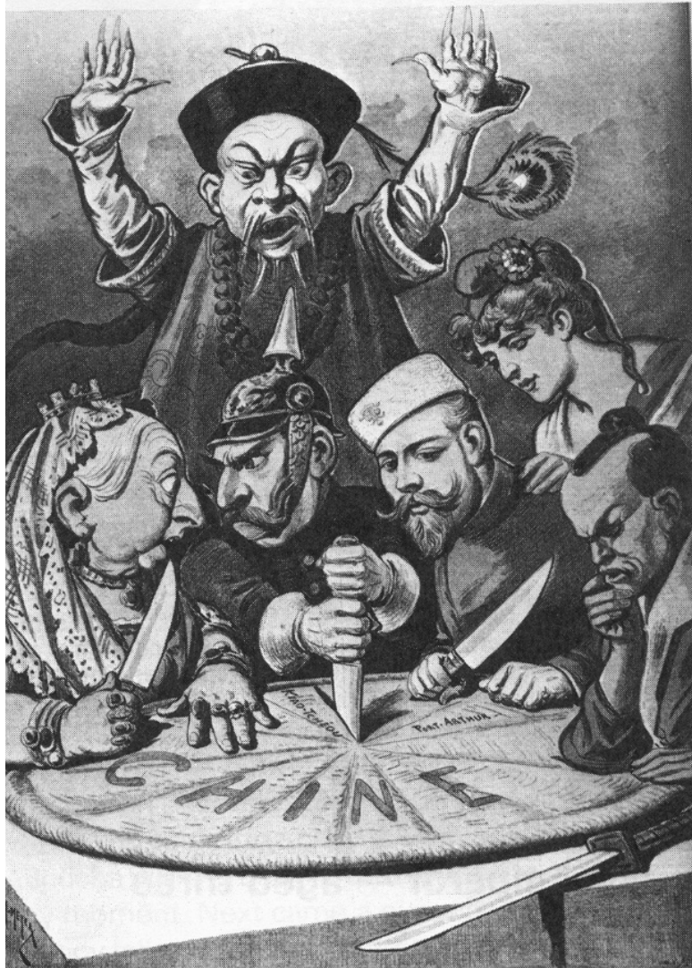
Foreign powers carve up China.

24 Study the cartoon, and then answer the questions which follow.