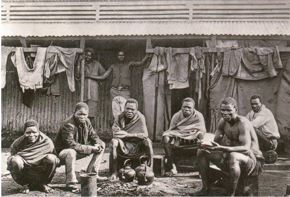
Black mine workers in their compound in the early-twentieth century.

17 Study the photograph, and then answer the questions which follow.